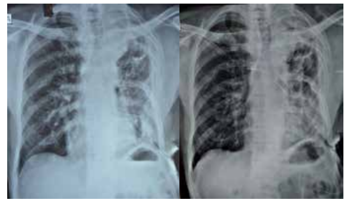
Figure 3. Pre- and post-stenting chest radiographs.