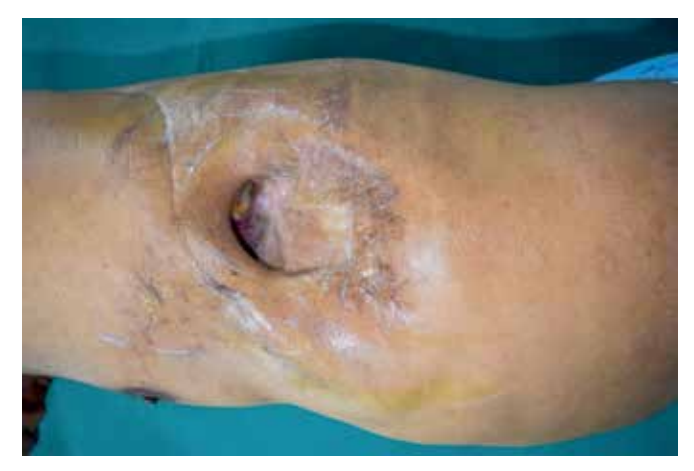
Figure 1. Photograph of the patient showing post-operative bronchopleuro-cutaneous fistula.

Computed tomography (CT) of the chest revealed left upper lobe bronchus communicating with pleural cavity (max diameter of 5.3mm) with pneumothorax (maximum 10mm) with a (21.6mm × 48.5mm) defect in the left lateral chest wall in the left lower lobe region. Thus, CT was used for stent sizing with the left main bronchus of 10mm and