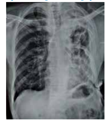
Figure 4. Chest radiograph (postero-anterior view) after 11 weeks of the procedure showing collapse of the left upper lobe.

Covered stent placement in lieu of surgery to close the effected lobe with multiple leaks has not been tried as a modality of treatment for broncho-pleural-cutaneous fistula.